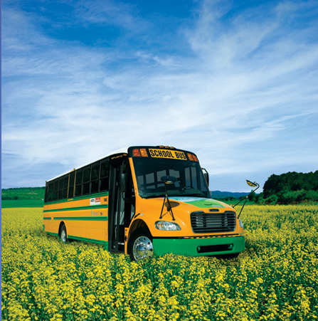
Thomas Built Hybrid School Bus: $40,000