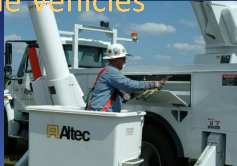
Altec Aerial Boom Vehicle with ePTO and Exportable Power: $32,000