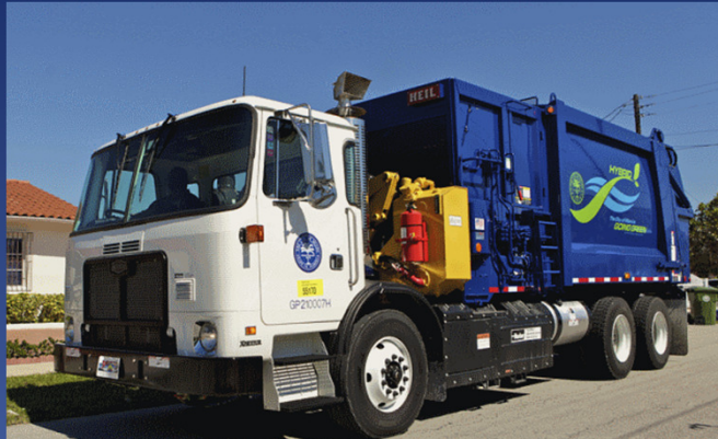
Autocar/Parker Hydraulic Hybrid Refuse Hauler: $45,000