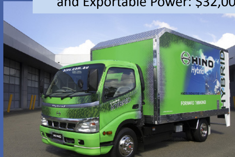
Hino Cab Over Hybrid Truck: $25,000